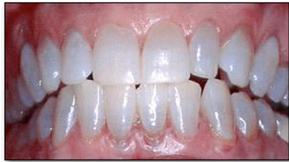
Figure 1. Group B patient. A. Prior to bleaching. B. One month after bleaching.