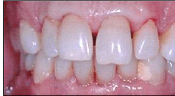
Figure 2. A second Group B patient. A. Prior to bleaching. B. One month after bleaching.